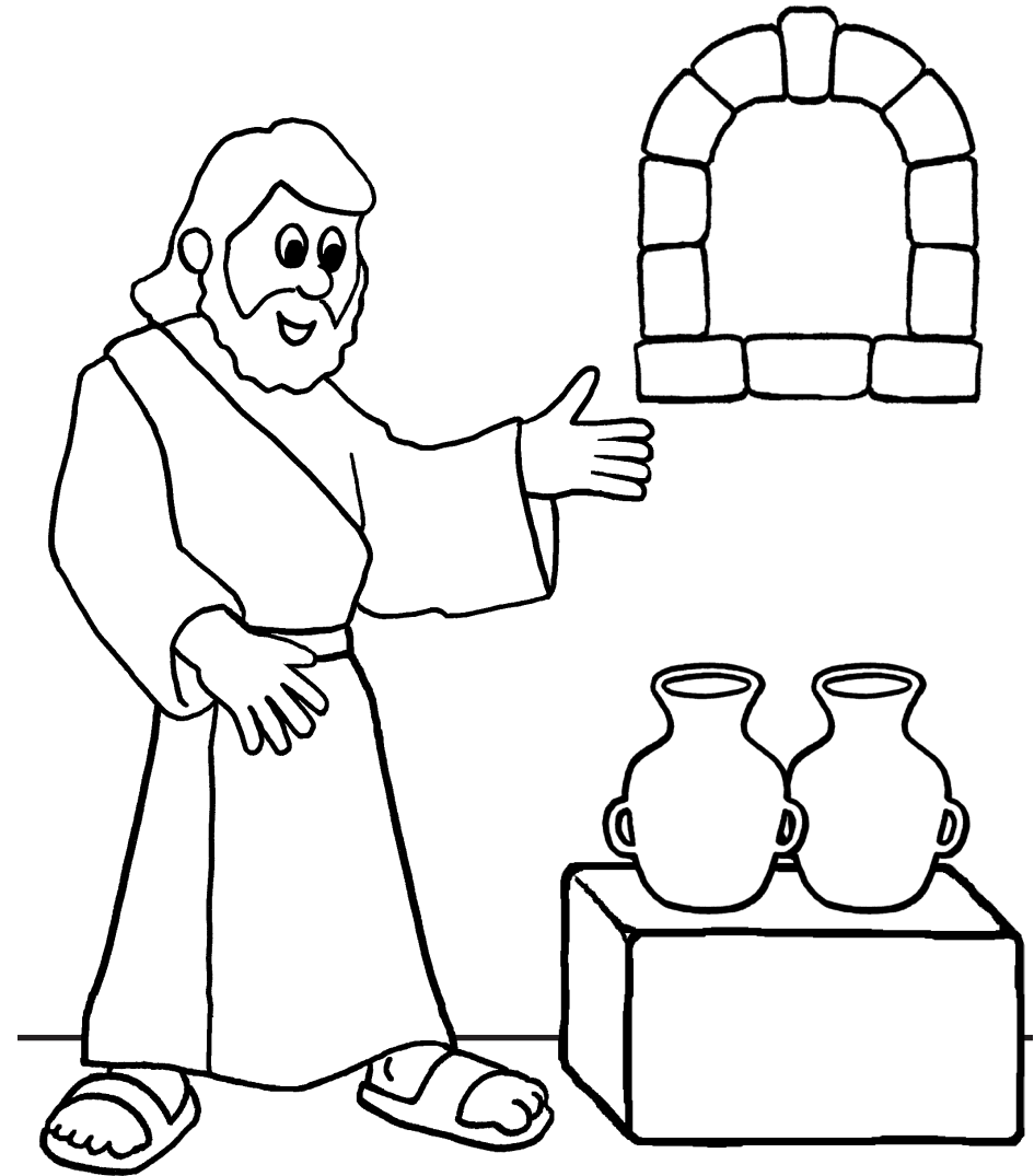
Jesus turned water into wine at a wedding in Cana.