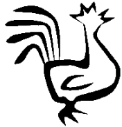
When I wake up