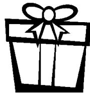
When I'm thankful