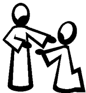
When I need help