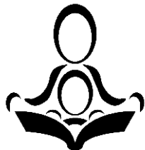
With my family