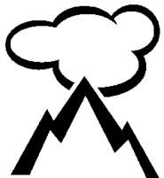
Outside in nature